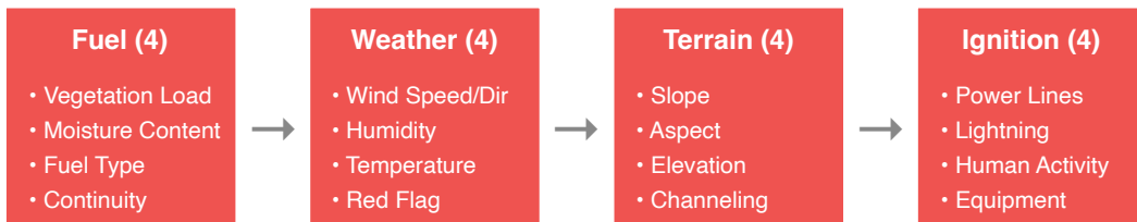
Figure 2: Wildfire Agents Part 1